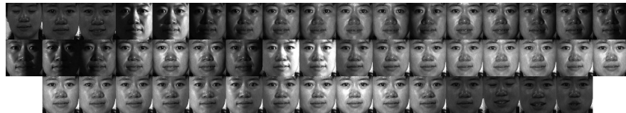
Fig. 4. Some images for one person in the PIE database

we use 22 images to form the training set. Of these 22 images, we randomly select p \in \{3, 4, 5, 6\} images and label them, leaving the remaining images unlabeled. Each setting is also repeated 10 times. Table 2 reports the average results over the 10 trials. From the results, we can see that our method again gives the best performance.