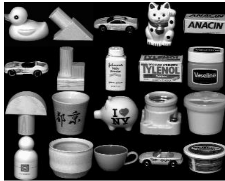
Fig. 5. Some images for different objects in the COIL database