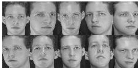
Fig. 3. Some images for one person in the ORL database

We use the ORL face database [5] for the first experiment. The ORL face database contains 400 face images of 40 persons, each having 10 images. These face images contain significant variations in pose and scale. Some images from the database are shown in Figure 3. We randomly select seven images for each person to form the training set and the rest for the test set. Of the seven images for each person, p \in \{2, 3\} images are randomly selected and labeled while the other images remain unlabeled. We perform 10 random splits and report the average results across the 10 trials. Table 1 reports the error rates of different methods evaluated on the unlabeled training data and the test data separately. For each setting, the lowest classification error is shown in bold. Since S^2 PPCA exploits the structure of unlabeled data, we can see that its performance is better than PLDA and SPPCA. Moreover, S^2 HPLDA relaxes the homoscedasticity assumption and so it achieves better performance than its homoscedastic counterpart S^2 PPCA in our settings. From Table 1, we can see that the performance of PLDA is very bad, probably because it gets trapped in an unsatisfactory local optimum when running the EM algorithm.